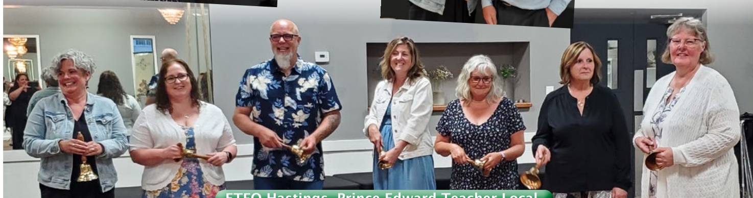
ETFO Hastings-Prince Edward Teacher Local