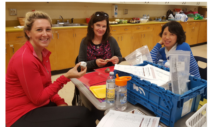
Pictured Above: Members attending the Rocks and Minerals Workshop , held on October 19 th .