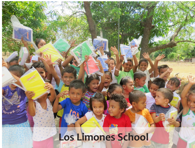
Los Limones School

The students were all smiles as they received their educational packages.