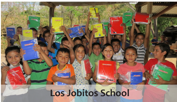
Los Jobitos School

Your generosity is continually 'Making Education Possible'! Thanks for such amazing supporters!