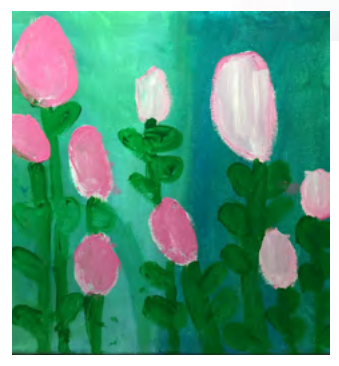
My daughter's painting. (She's 6 and absolutely loved following along!) Carrie 5