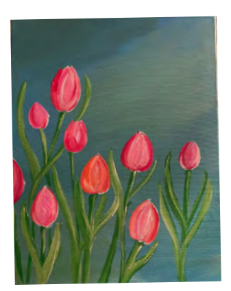
Thanks everyone! Nice to have a different focus tonight.