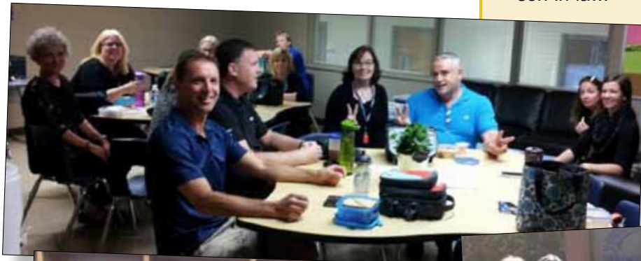
◀ Prince Of Wales