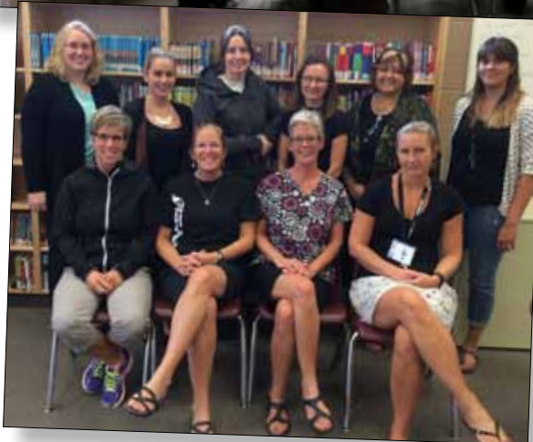
▲ Birds Creek