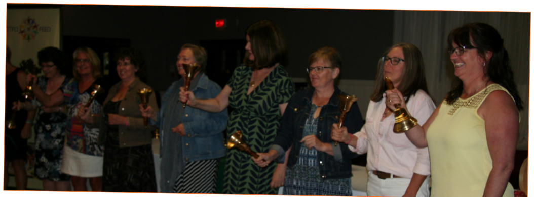
The Ringing of the Bells