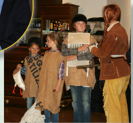
Belleville Theatre Guild actors from "Annie Get Your Gun" entertain ETFO members.