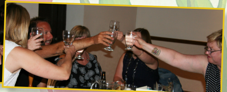
ETFO members "Toast to the Retirees"